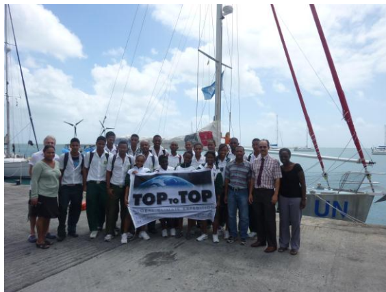
Students from College de Port Mathurin in Rodrigues Visit PACHAMAMA after TOPtoTOP presentation

The traveling team is engaged in educational activities with schools and universities all over the world, inspiring for clean energy solutions. So far they have sailed over 40’000 nautical miles in their expedition vessel, climbed 400’000 vertical meters, cycled over 18’000 kilometres and visited over 50’000 students!