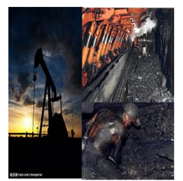
Uncontrolled exploitation of resources (coal, oil) for economic development

Nobody could fail to remember clearly the world famous Copenhagen Conference, which meant to solve the problems of climate changes and to avoid the disasters brought by climate changes via cooperation between different countries. Nobody could fail to recognize that the climate is becoming stranger and stranger, not the same as before from personal experiences—more Natural Disasters, unpredictable changing temperatures, deterioration of ecological environment. Definitely, The earth is suffering thousands of sore bruise because of human activity----uncontrolled exploitation and plundering of natural resources. It is universally acknowledged that driven by economic benefits, people of environmental consciousness making short-term benefits at the expense of sacrificing the environment have worsened the ecological environment and changed the climate.