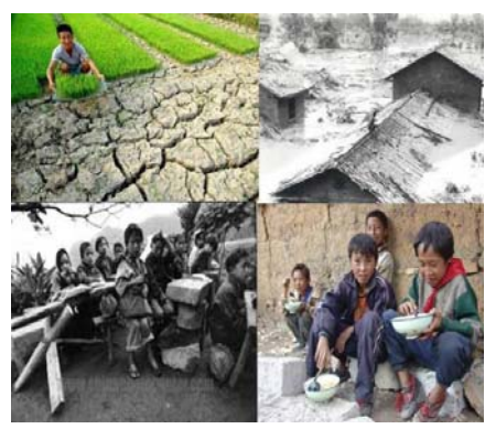
Lots of death and loss are contributed by frequent drought and flood, making poor districts poorer, no enough food and no education