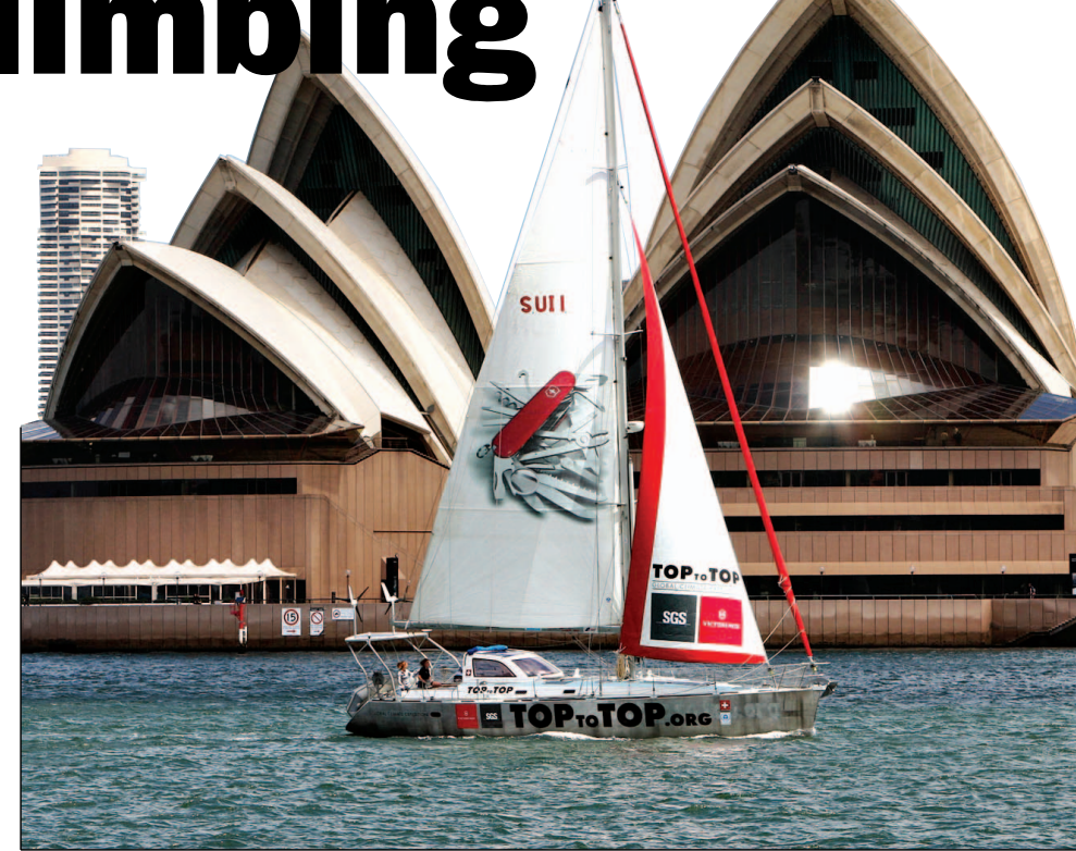
'Pachamama' sails by the iconic Sydney Opera house