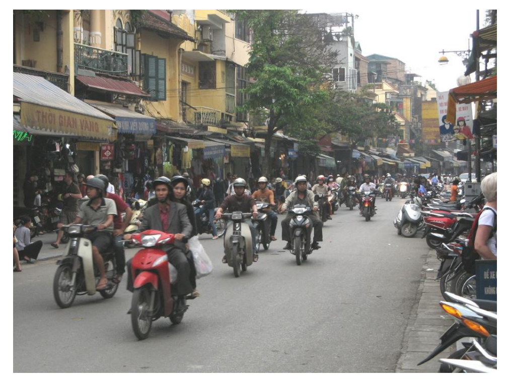
Typical street scene from Hanoi with nothing but motorcycles

For me, another piece of work was due in Vietnam and I made two trips back to Hanoi for the Urban Rail project. Although I did not really enjoy working with the Japanese in their factory-like office, I did go back at the specific request of the Vietnamese National Railway team that appreciated my work and my approach to the problems faced. I left Hanoi, with the task to organize a study visit to Singapore for the Vietnamese team.