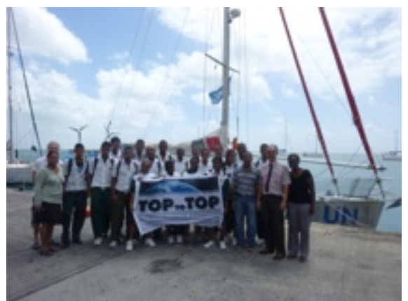
Students from College de Port Mathurin in Rodrigues visit PACHAMAMA after TOPtoTOP presentation