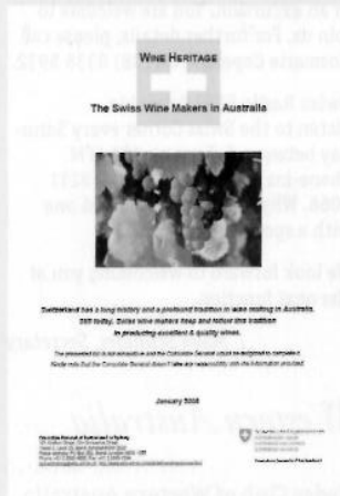
The Swiss Wine Makers in Australia, mentioning vineyards in Australia with close Swiss ties.

Kindly note that these lists are not exhaustive and that the Consulate General would very much appreciate receiving any input in order to keep them updated.