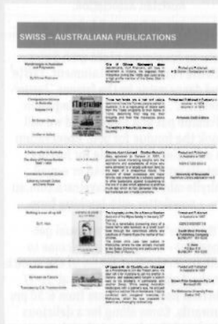
The Swiss-Australiana publications, consisting of books written by Swiss citizens related to Australia

The Consulate General of Switzerland is proud to inform you that two additional publications - apart from the already existing Cultural Calendar, where Swiss events, organised by this Consulate General and the Embassy in Canberra, are being promoted - have recently been added to its website at www.eda.admin.ch/eda/en/home/reps/ocea/vaus/cgsyd.html :